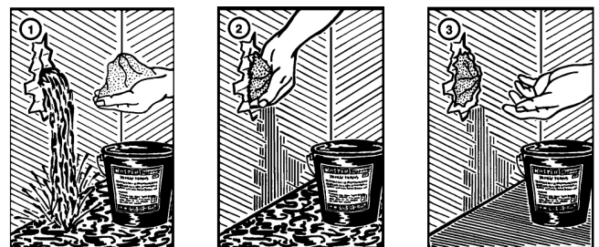
Leaks... ..stopped... ..in seconds!

We suggest using smooth rubber gloves when processing KÖSTER KD 2.