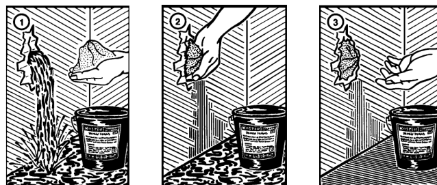
Leaks... ..stopped... ..in seconds!

We suggest using smooth rubber gloves when processing KÖSTER KD 2.